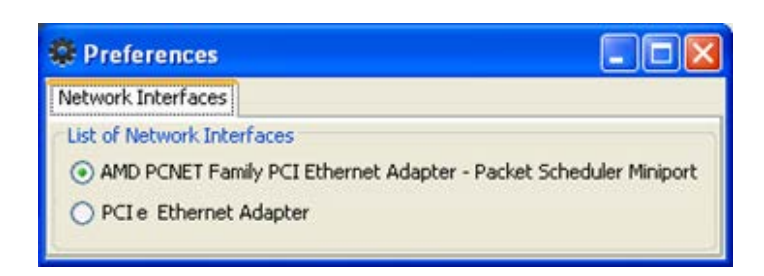
Figure 5 Preferences window

➤ In case of multiple network interfaces installed on the PC, button will let the user access the Preferences window. This window (see Figure 5) shows the list of all the detected Ethernet interfaces, making it possible to select the one desired.