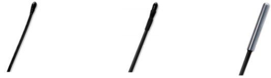
Figure 1: ZAC-NTC68S/E/F