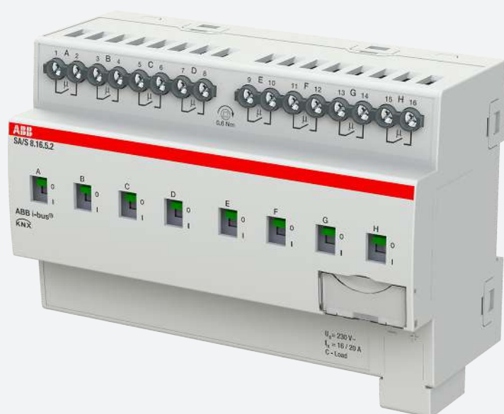
ABB i-bus ® KNX SA/S 8.16.5.2 Switch Actuator