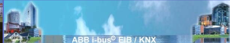
ABB i-bus ® EIB / KNX