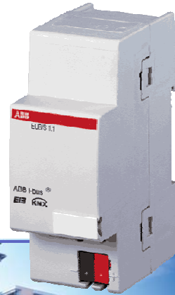
ABB i-bus ® EIB / KNX