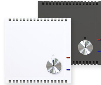
SK30-TC-CO2-R white / anthrazit