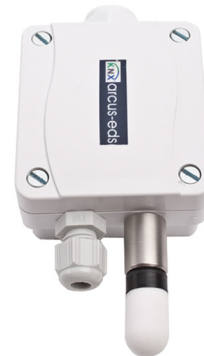
SK10-TTHC-AFF + ext. PT1000 Connector