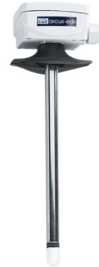
SK10-TTHC-KFF + ext. PT1000 Connector