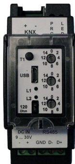
KNX-GW2-RS485-2TE Art.-No.: 40210182

Depending on the command length, approx. 1200 serial commands can be stored on the KNX-to-serial gateway. The group addresses used are defined together with the command chains to be sent in a project file and transferred via the USB interface. The physical address is set using the configurator.