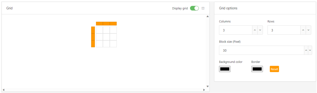
Figure 4 Free Component - Grid and Grid Options

With the icon located directly to the right, the Free Component is displayed in full-screen mode. This is helpful if there is not enough space in this field.