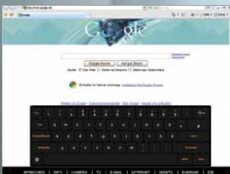
Internet / e-mail