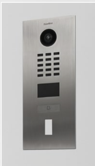
ekey Fingerprint Reader Module not included in delivery.