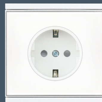
Corlo Power Outlet, white/white matt