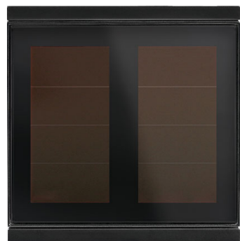
Corlo P1 RF Single Solar Push Button, black/black matt