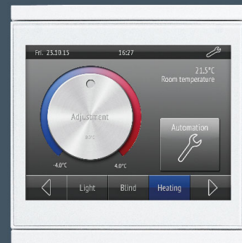
Corlo Touch KNX, white/white matt