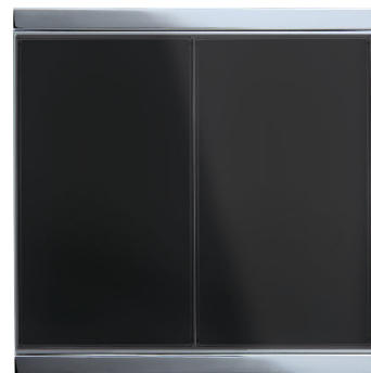
Corlo M2-T Double Push Button, black/chrome glossy