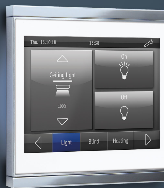
Corlo Touch KNX