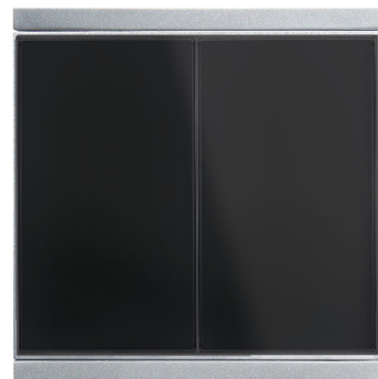
Corlo M2-T Double Push Button, black/chrome matt