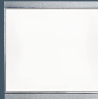
Corlo M1-T Single Push Button, white/chrome matt