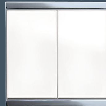
Corlo M2-T Double Push Button, white/chrome glossy