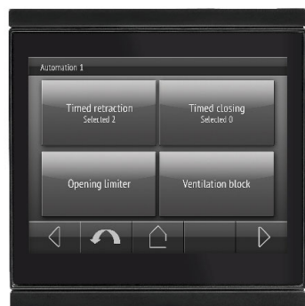
Corlo Touch KNX WL, black/black matt