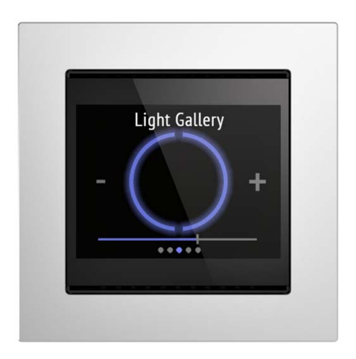
Illustration with frame (not included in the deliverables)

Cala KNX AQS/TH: 70603 (black), 70608 (white) Cala KNX TH: 70602 (black), 70607 (white) Cala KNX T: 70601 (black), 70606 (white)