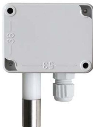
Fig. 2 Rear view with dimensioning of openings for mounting