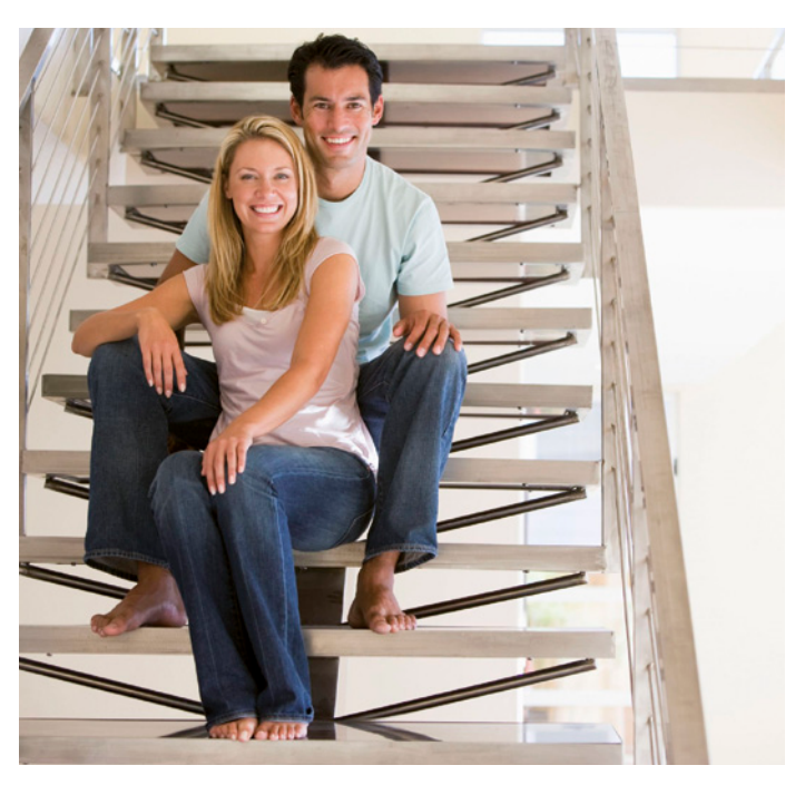
A system designed for people