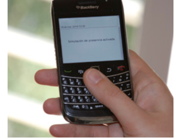
GSM remote control