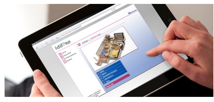
Integrated web server