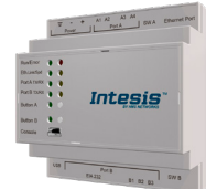
INKNXHITXXXO000 VRF Systems 16/64 Indoor Units