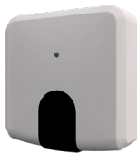
INKNXUNIO01I000 Universal Infrared AC 1 I.U. with Binary Inputs