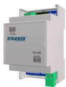
INMBSHIT001R000 VRF Systems 1 Indoor Unit