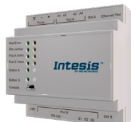
INMBSHITXXXO000 VRF Systems 16/64 Indoor Units