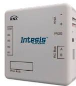
INKNXHIT001R000 VRF Systems 1 I.U. with Binary Inputs