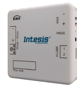
INKNXHIT001A000 A2W 1 Indoor Unit