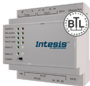
INBACHITXXXO000 VRF Systems 16/64 Indoor Units