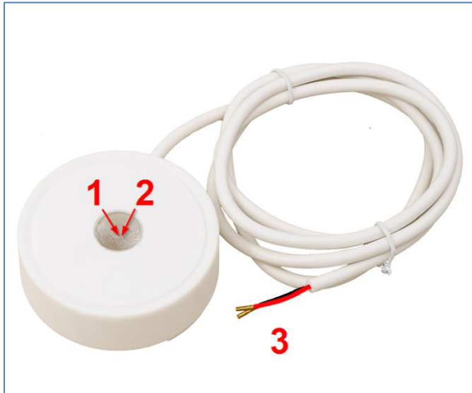
Figure 2: Structure & Handling

The following picture shows the structure of the device: