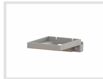
Mounting angle 200.002