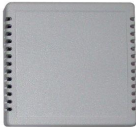
Fig. 1: KNX RF/TP Coupler 670