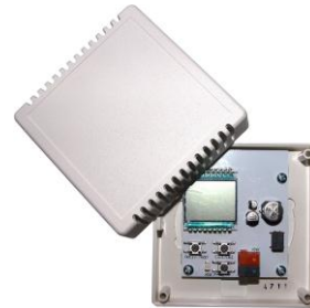
Fig. 2: KNX RF/TP Coupler 670 open

When selecting the mounting location for the WaveLink you have to consider the position and the range of the KNX-RF devices which have to be associated with the WaveLink. You should avoid shielding objects (eg metal cabinets) or jamming objects (eg computers, electronic transformers, ballasts ...) close to the WaveLink.