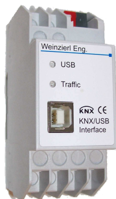
Figure 1: Photo of device

This interface is for establish a bidirectional connection between a PC and the EIB/KNX installation bus. The USB connector has a galvanic separation from the EIB/KNX bus. Both ETS (Engineering Tool Software) versions ETS3 or later and some Visualization tools support this interface.